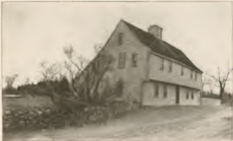
THE OLD BENNETT HOUSE, SAUGUS, MASS.